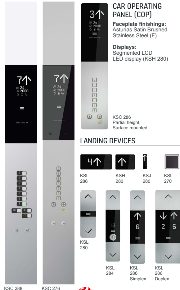
KSC 276 Full height, Full height, Flush mounted Flush mounted

Available with a partial or full-height COP, it features a sleek, hardwearing stainless steel faceplate and clear segmented LCD displays for the COP and landing devices.